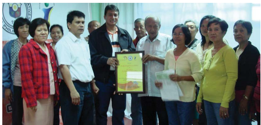
Facilitating a ‘competition for development’ among Team Energy beneficiaries - July 2008