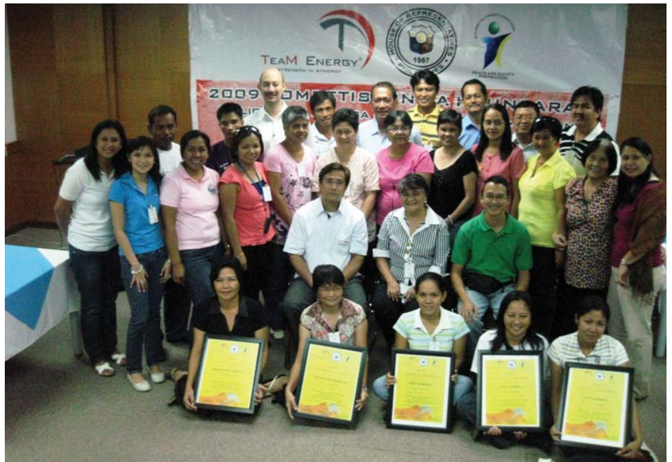
Awarding of winning proposals in Pagbilao, Quezon