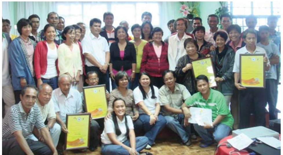
Awarding of winning proposals in Sual, Pangasinan